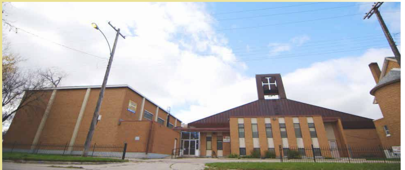
Gonzaga Middle School is set to open its doors in September, 2016.