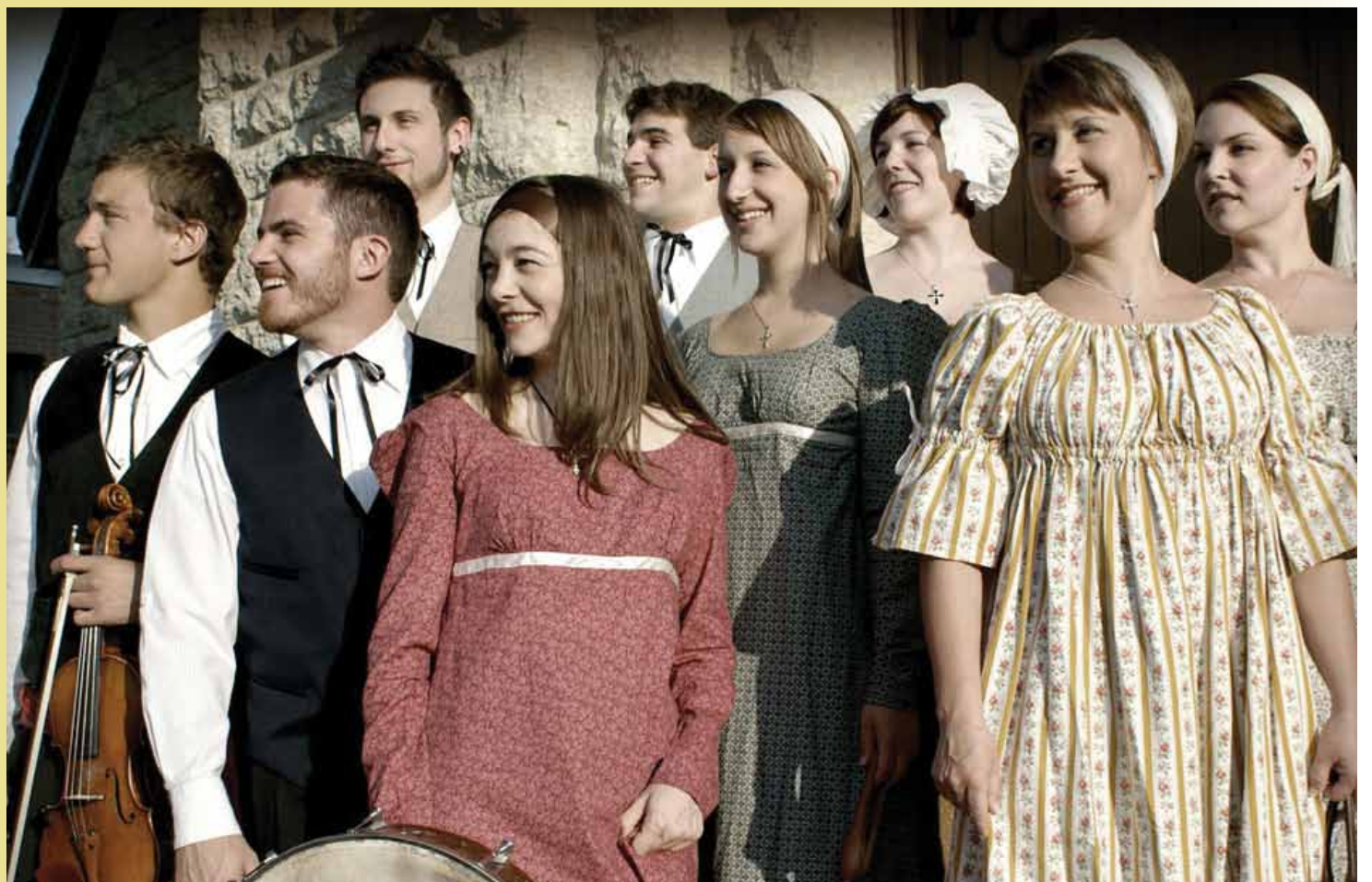
The Catholic Schools of Manitoba are preparing for the 2013 CCSTA AGM, which will be hosted in Winnipeg. Organizers have set an exciting agenda, which will include cultural performances!

Lors des cérémonies d'ouverture, tous nos sens seront charmés par la célébration des peuples de la Rivière Rouge, des Premières Nations, des Métis, des Écossais et des Canadiens- LA SUITE À LA PAGE 3