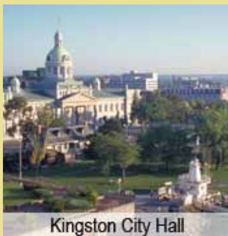
Kingston City Hall