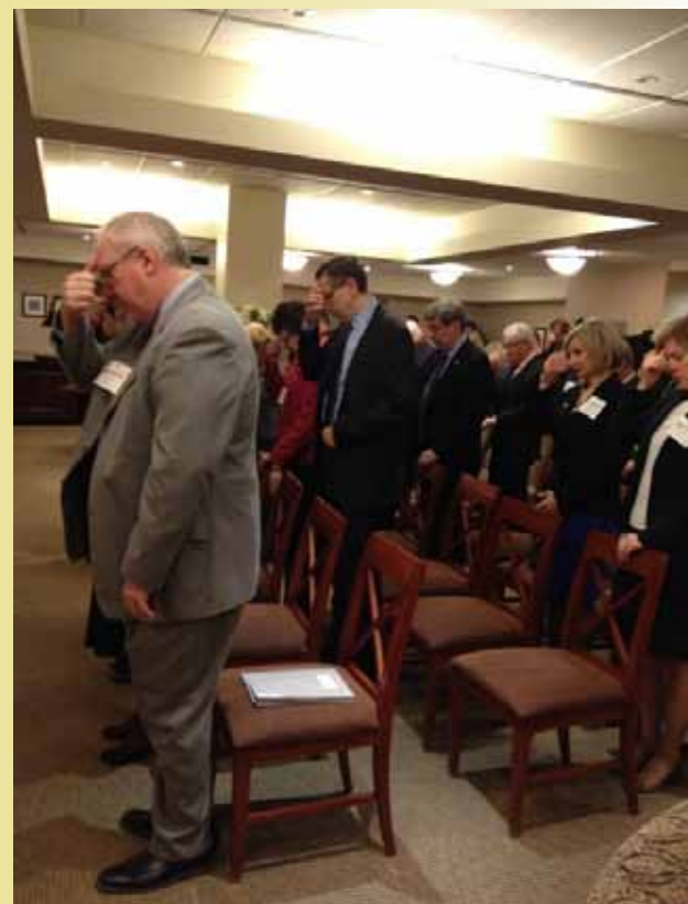
Following a successful first event in 2012, another joint conference between the SCSBA and the Catholic Health Association of Saskatchewan (CHAS) is scheduled for this fall.

The campaign is to include public service announcements, posters, newspaper advertisements and social media promotions. This public