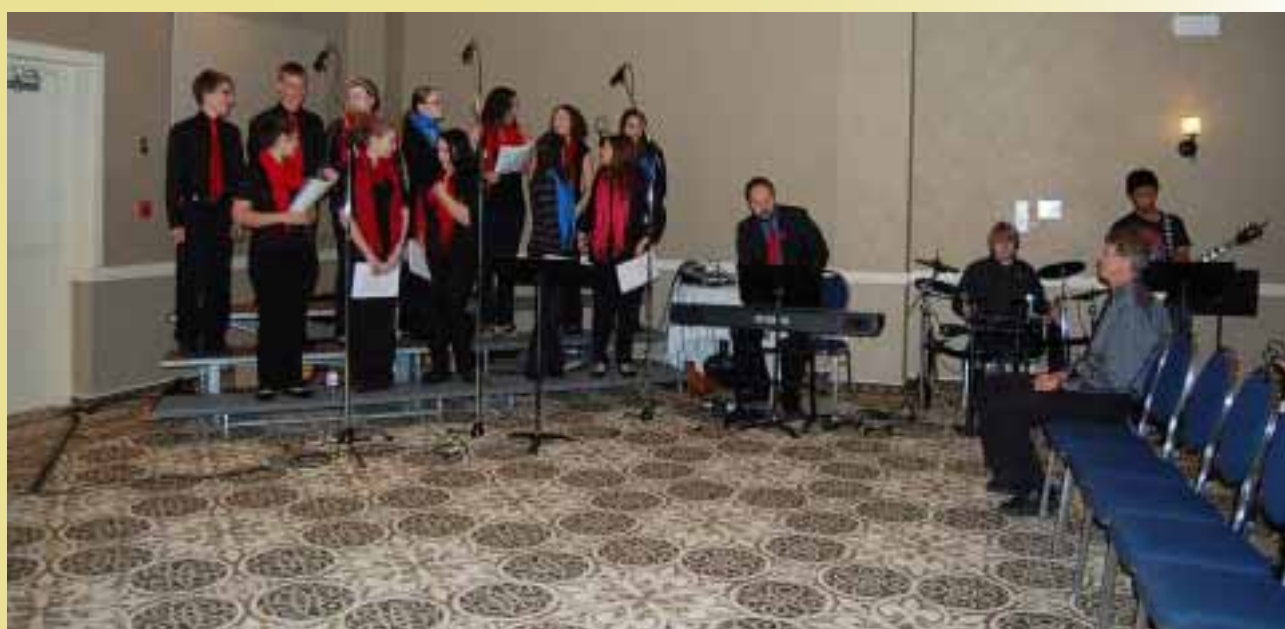
Following a successful first event in 2012, another joint conference between the SCSBA and the Catholic Health Association of Saskatchewan (CHAS) is scheduled for this fall.

If you have any questions or comments about ACSTA or our programs, please call 780/484-6209, email admin@acsta.ab.ca or check out our website at www.acsta.ab.ca or follow us on twitter @ACSTANews.