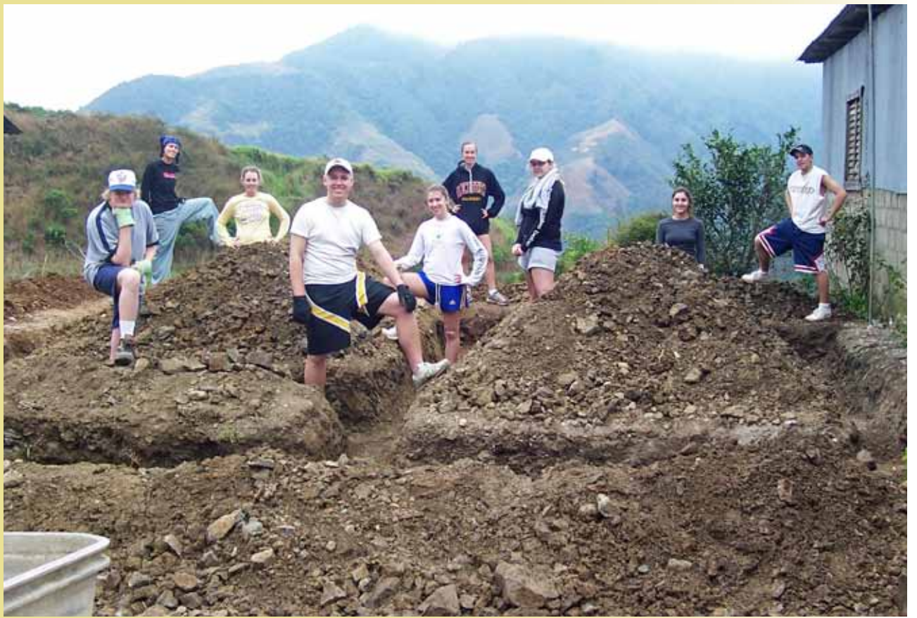
St. Mary C.S.S. students (Hamilton-Wentworth CDSB) serving the needs of others in the Dominican Republic.

For more information visit: http://www.faithinourfuture.ca/student-video/