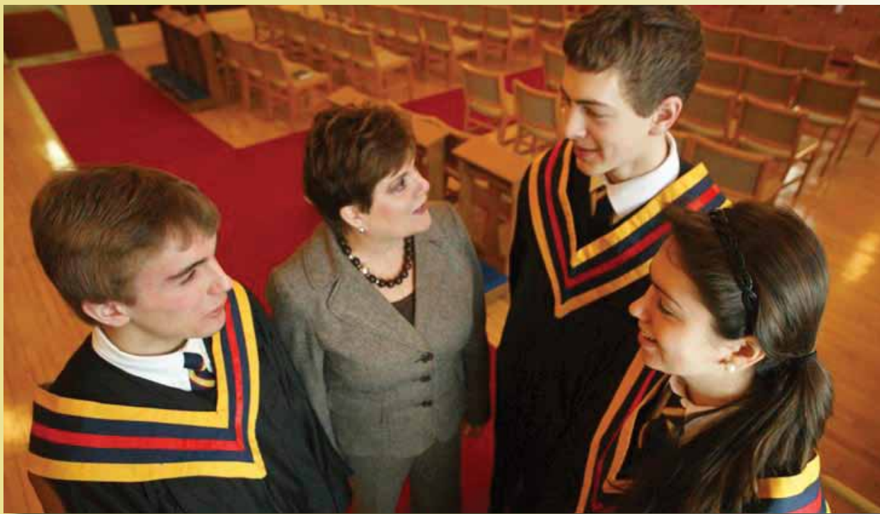
St Bonaventure's College, located in St. John's, NL, is a K-12 co-educational school which opened as an independent Catholic school in the Jesuit tradition in 1999.

a) des activités ou des organisations qui encouragent l'équité entre les sexes;