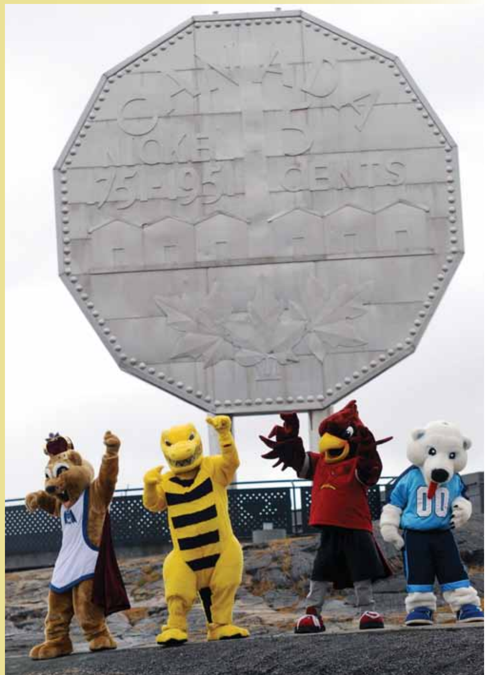
Sudbury's Secondary School mascots recently met at the the local icon, the Big Nickel, to welcome CCSTA AGM delegates!